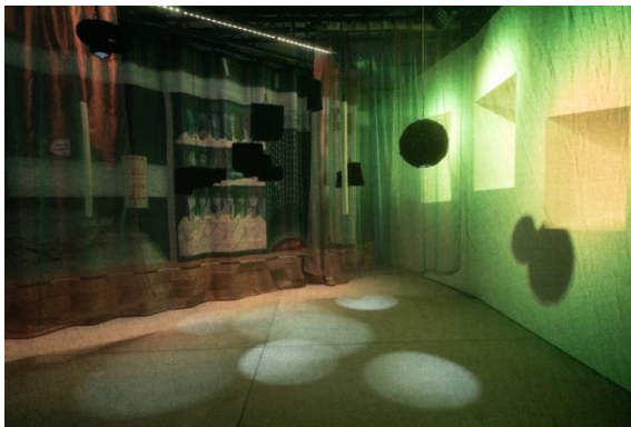
Mechanical Installation by Ng Tsz-kwan