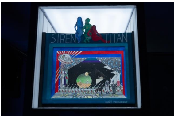
Tunnel Book Installation by Ho Sin-tung