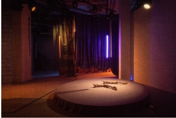
Mechanical Installation by Tung Wing-hong